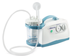
Portable Suction Pump