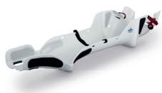
Pawsitioner Positioning Aid