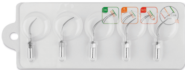
STANDARD Scaler Tips